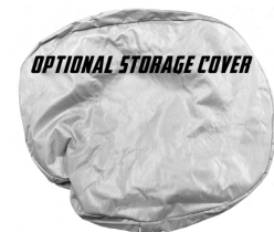
OPTIONAL STORAGE COVER

We recommend our storage cover for your motor if you are going to leave it sit outside during the winter months. Our storage cover will breathe and let out moisture.