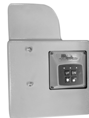
RECOMMENDED HARD COVER

Helps protect the motor all summer long from rain and other elements. Covers up the spinning gear head for extra safety. Back of cover is left open so it doesn't create condensation. Cover fits Vertical and Horizontal units. Will not fit the PWC or Wheel Drive motor.