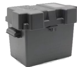
Optional Battery Boxes

Plastic battery box that will fit Group 24 and 27 series deep cycle batteries. If your battery leaks for any reason, it will help protect the boat from getting battery acid on it.